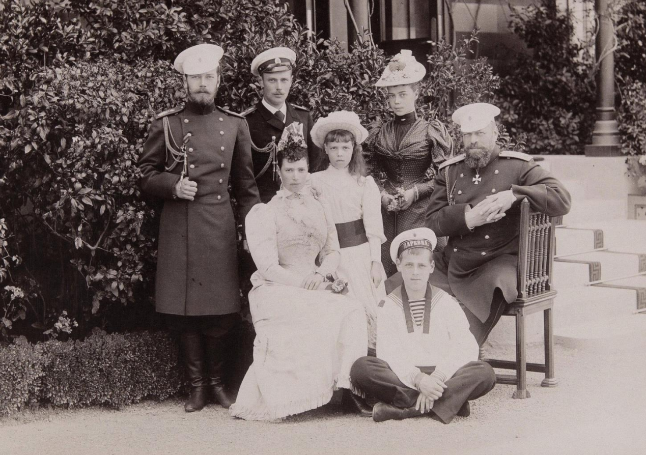
Romanov family in Livadia, Crimea, May 1893—the last known family photograph of Emperor Alexander III. Left to right: Nicholas (future Emperor), George, Olga, Xenia, Maria Feodorovna, Alexander III, and Michael.