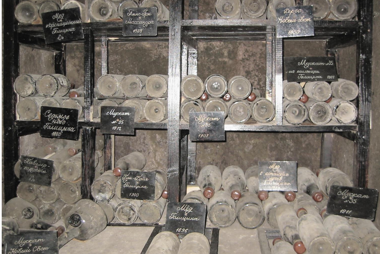
Romanov historical wines in Massandra cellars