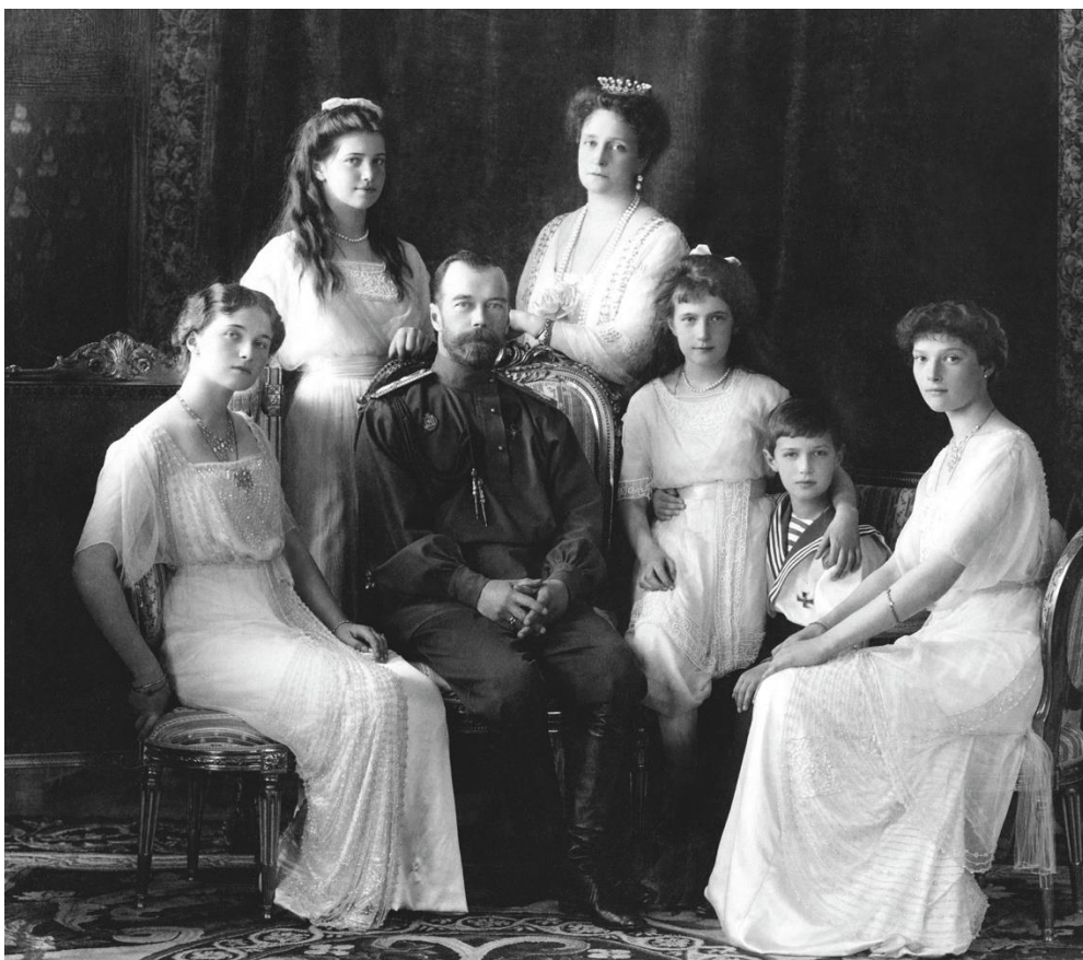
Nicholas II of Russia with the family (left to right): Olga, Maria, Nicholas II, Alexandra Fyodorovna, Anastasia, Alexei, and Tatiana. Livadiya, Crimea, 1913.