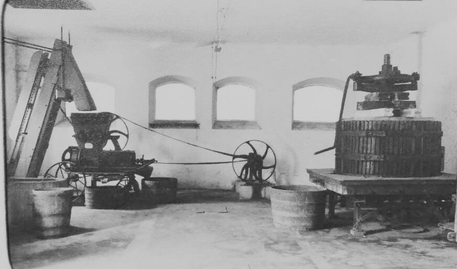
Winery operations: traditional presses and mechanical grape crushers equipment, Crimea, early 20th century.