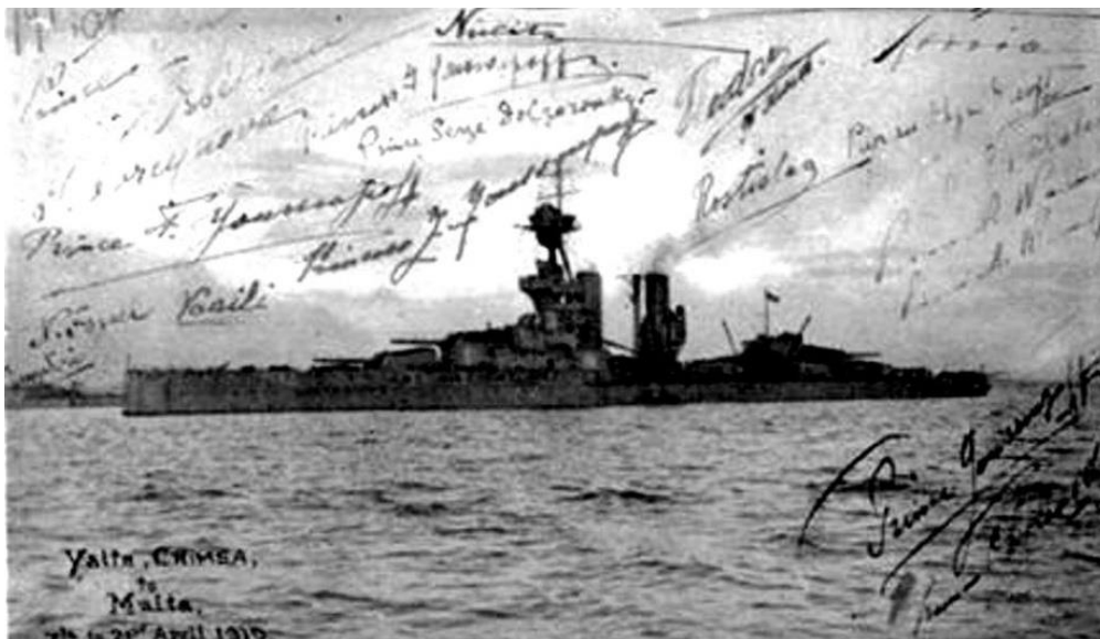
HMS Marlborough, autographed by many of the Imperial passengers

The rescue was a race against time. Bolshevik forces were advancing rapidly, and the collapse of order was nearly complete. In the eerie calm before their arrival, the royal party — elderly, bewildered, and clinging to their last vestiges of dignity — was ferried HMS Marlborough, autographed by many of the Imperial passengers through the night across the wine-scented hills and orchards of Crimea to the British ship.